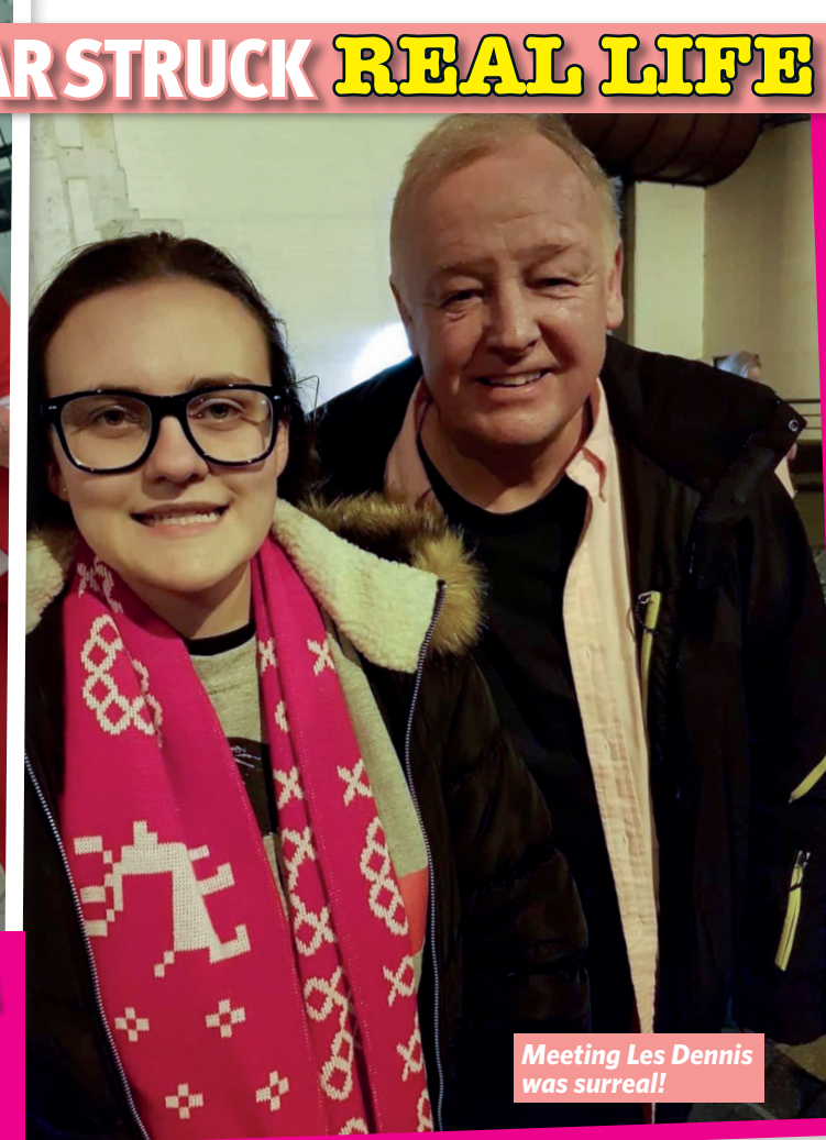
Meeting Les Dennis was surreal!