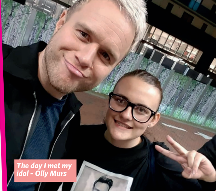
The day I met my idol - Olly Murs