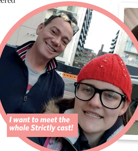
I want to meet the whole Strictly cast!