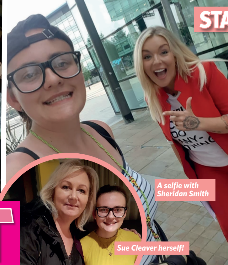
A selfie with Sheridan Smith