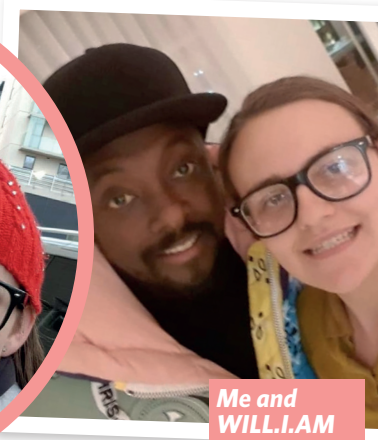
Me and WILL.I.AM